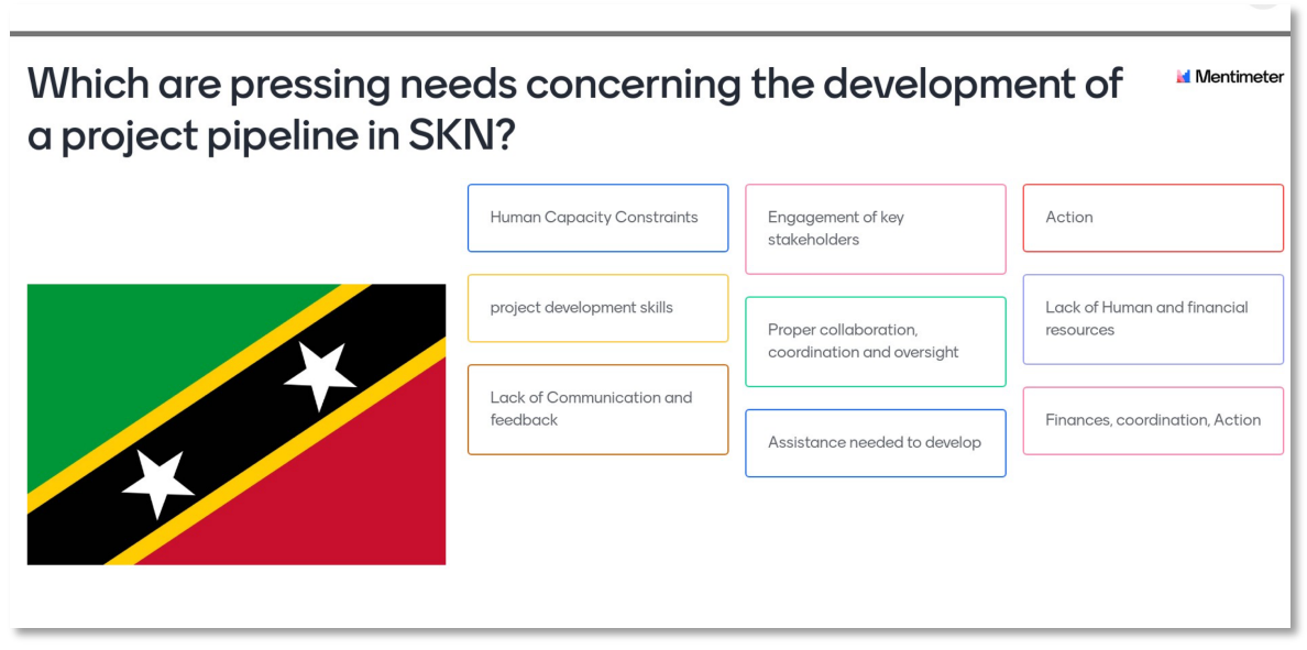
Figure 3: Responses concerning needs for developing a project pipeline

Emanating from strategic frameworks and entity work programmes, it is important, that a country develops and maintains a transformational pipeline of quality concept notes and funding proposals. St Kitts and Nevis is fostering such pipeline development, but still experiences challenges. During the workshop held with key stakeholders in May 2022, when asked about most important needs in the context of developing a pipeline of projects, participants mentioned various aspects including for human capacity development, stakeholder engagement and better coordination.