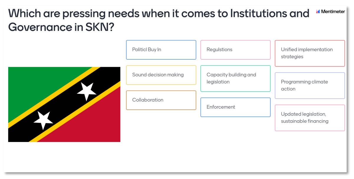
Figure 1: Responses concerning needs for institutions and governance

Responsibility for climate matters in St. Kitts and Nevis is shared amongst several ministries, including the Ministry of Sustainable Development; Ministry of Agriculture Fisheries and Marine Resources Ministry of Environment and Cooperatives, Ministry of Tourism, Ministry of Public Infrastructure; and Ministry of Finance. Ensuring effective coordination and communication amongst these ministries is therefore vital to avoid project duplication. It will also help to facilitate a synergized and integrated national approach to climate change adaptation, and support ministries on approaches to planning and implementing adaptation and climate resilient development activities. During a workshop held with key stakeholders in May 2022, when asked about most important needs in the context of institutions and governance, the sentiment was that better coordination and collaboration are at the core.