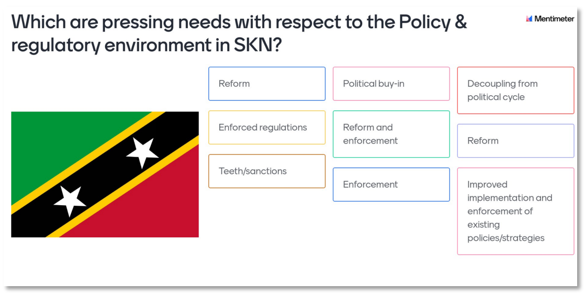
Figure 2: Responses concerning needs for policy and regulatory environment

programme, an Urban Resilient Plan for Greater Basseterre, as well as this Long-term-Readiness Needs Assessment Plan (all of which are forthcoming in late 2022). Moreover, the GCF Readiness funding supports strengthening the country's capacity for resilient planning by developing a National Development Planning Framework (NDPF). Upon completion of the NDPF (targeted for January 2023), it will reinforce the planning framework that embraces climate change resilience through the NDPF's defined development priorities, strategies and targets to be achieved over the period 2023-2037. While this policy framework is established and under elaboration, it must also be operationalized. During the workshop held with key stakeholders in May 2022, when asked about most important needs in the context of policy environment, in particular enhanced enforcement was highlighted as an important need by the participants.